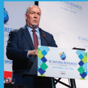
Premier John Horgan, Government of British Columbia